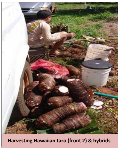
Harvesting Hawaiian taro (front 2) & hybrids