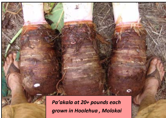
Pa'akala at 20+ pounds each grown in Hoolehua, Molokai

He set goals for the selection of superior seedlings, including less than 6 oha, no runners, and oha attached close to the makua or mother plant. However, one of the most important goals was to find a selection with a purple corm having high tolerance to Taro Leaf Blight combined with good poi characteristics. Crossing a light pink corm of Ngeruuch with a beautiful purple corm of Maui Lehua, you would expect 50% pink corms and 50% purple corms at best or maybe every shade from pink to purple. Instead, only 7% of the 200 seedlings or 14 seedlings exhibited purple corms. Taro doesn't appear to follow Mendelian genetics, and this is one of the challenges in breeding taro.