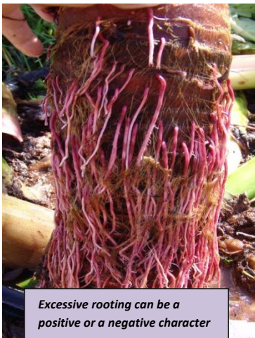
Excessive rooting can be a positive or a negative character

Depending on how you look at it, many oha can be a benefit if you're just starting to grow taro and you need a lot of planting material, or a shortcoming if you already have a lot of planting material. Twenty oha on each plant makes a lot of opala or rubbish after harvesting, and it needs to be dealt with. Some look at it as organic material to add to the lo'i after harvesting, while it could be a magnet for disease added back to the lo'i. There are also labor costs involved in dealing with all this plant material. But many taro growers and taro eaters will say you cannot beat the taste of poi made from Lehua maoli.