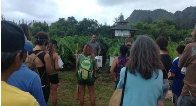
Waimanalo Field Day, June 21, 2013 – My presentation on Sustainable Dryland Taro Strategies

There's a whole resurgence of taro in Hawaii, and this has been brought upon by many factors. One of them was the uproar over the genetic modification of taro, but there were other factors as well. There are community-based initiatives to make poi available