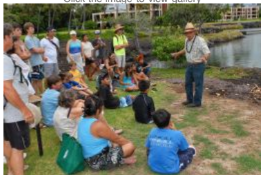
Click the image to view gallery